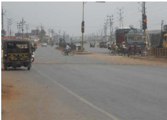
Fig 13: Improper Working of Traffic Signal.