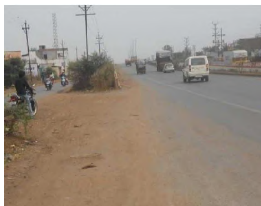
Fig 10: Intersection at Approach of Bridge. Zone-3: Kushalpur Square to Telibandha Square