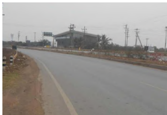
Fig 8 : Unsafe Bus-Stand