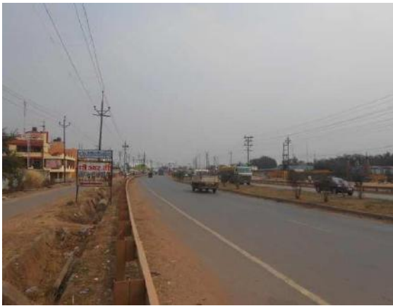
Fig 12: Requirement of Speed Limit Sign.