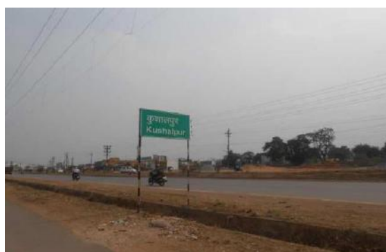
Fig 11: Road Side without Barrier.