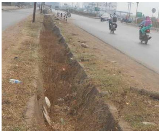
Fig 4: Road Side without Barrier.