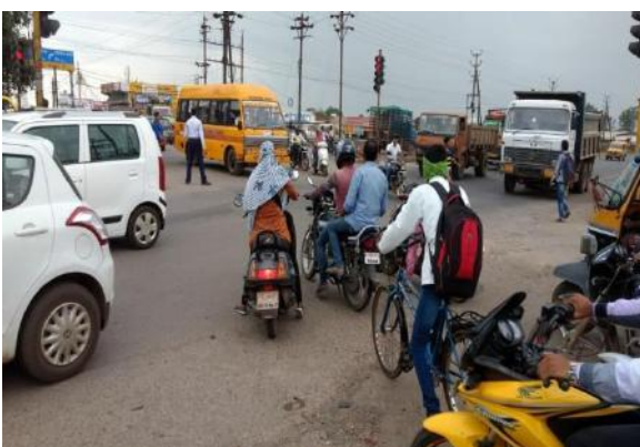
Fig 15: Heavy Traffic due to Traffic Signal Failure.