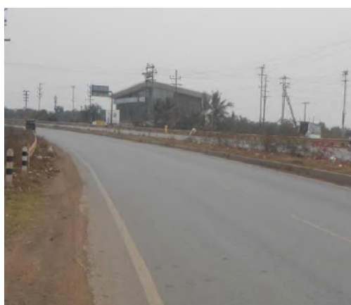
Fig 6: Road Turning without Sign. Zone-2: Volkswagon showroom to Kushalpur Square