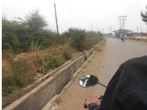
Fig 5: Unsafe Service Road