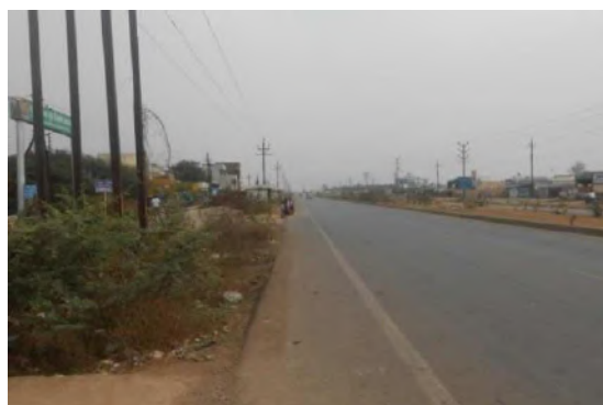
Fig 7: Road Side Growth of Plantation.