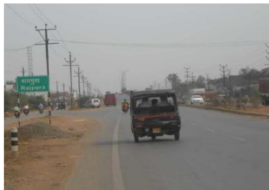
Fig 9 : Intersection of Bridge without Sign.