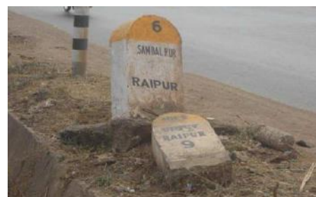
Fig 3: Falling of Milestones.