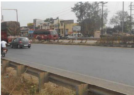
Fig 14: Improper Maintenance of Central Guard Rail.