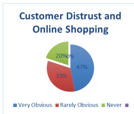
Fig 2. Pie-Chart Showing How Perceived Risk Discourage Online Due To Consumer Distrust.