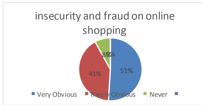
Figure 3: Pie-Chart Showing Effect of Insecurity and Fraud on Online Shopping Attitude of Nigerian Consumers Interpretation

From table 3, the analysis shows cases of online fraud, credit scam, hacking of customer personal information, consumer financial losses, lack of measure for consumers to seek redress against fraud and insecurity. This indices constitute fraud and insecurity to online shopping in Nigeria. Thus, chart above revealed that 51% of respondents opined its very obvious, 41% felt its rarely obvious while 8% felts it never occurs.