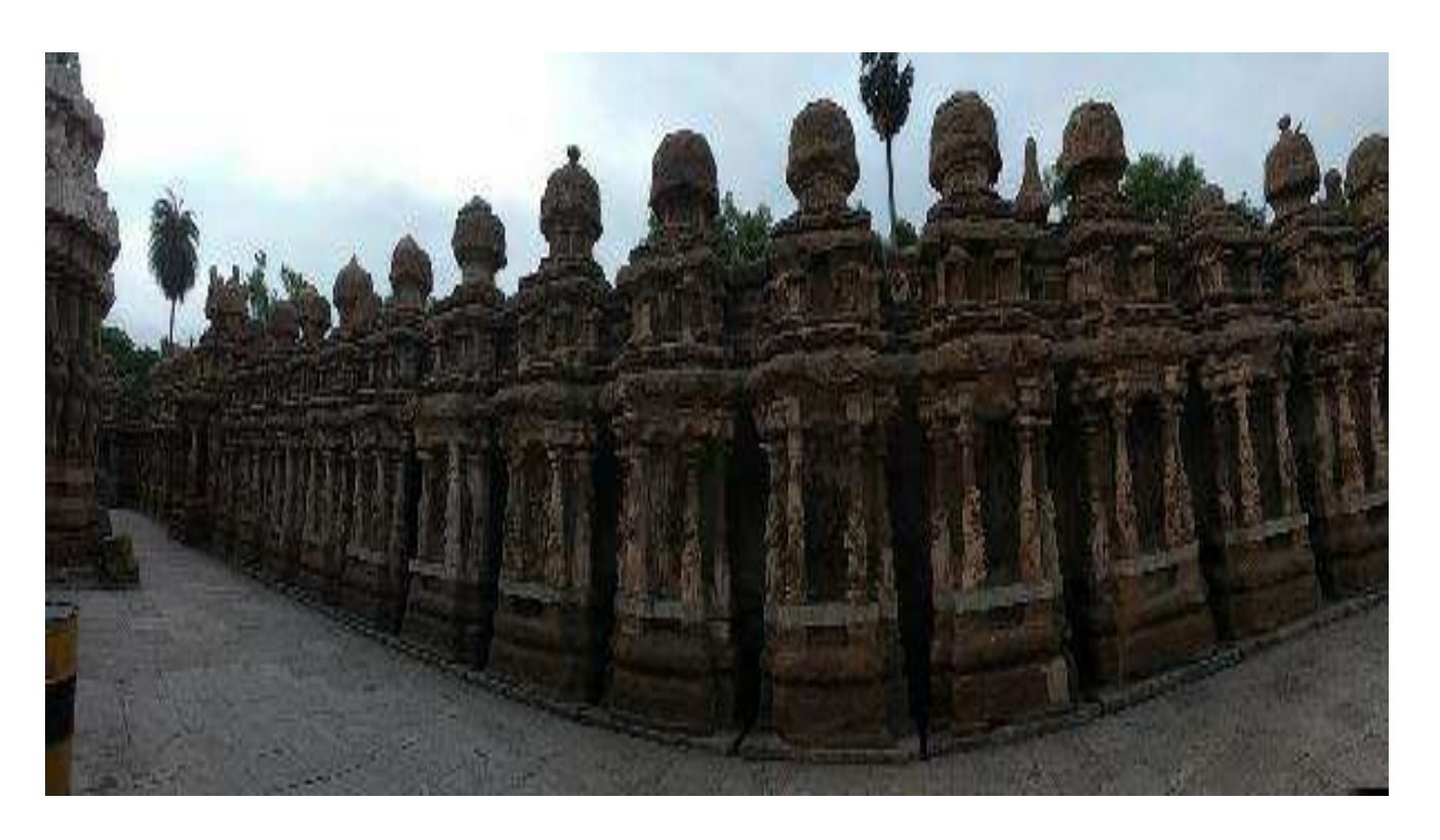
Figure 3 A view of the Vimana along with the Maha mandapa

Figure 2 An Array of small shrines on the inner side of the wall