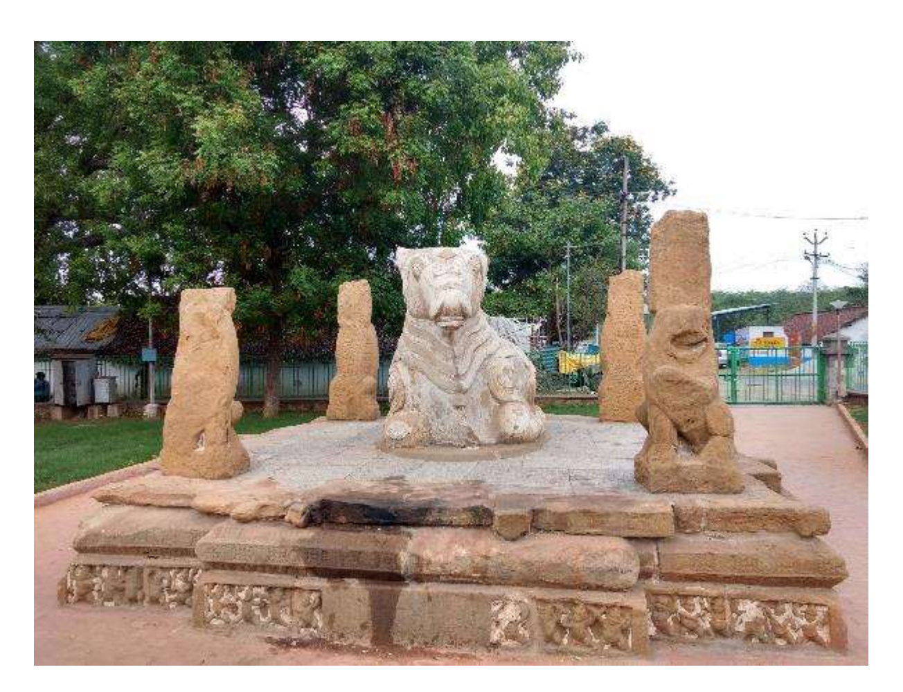
Figure 1The Nandi