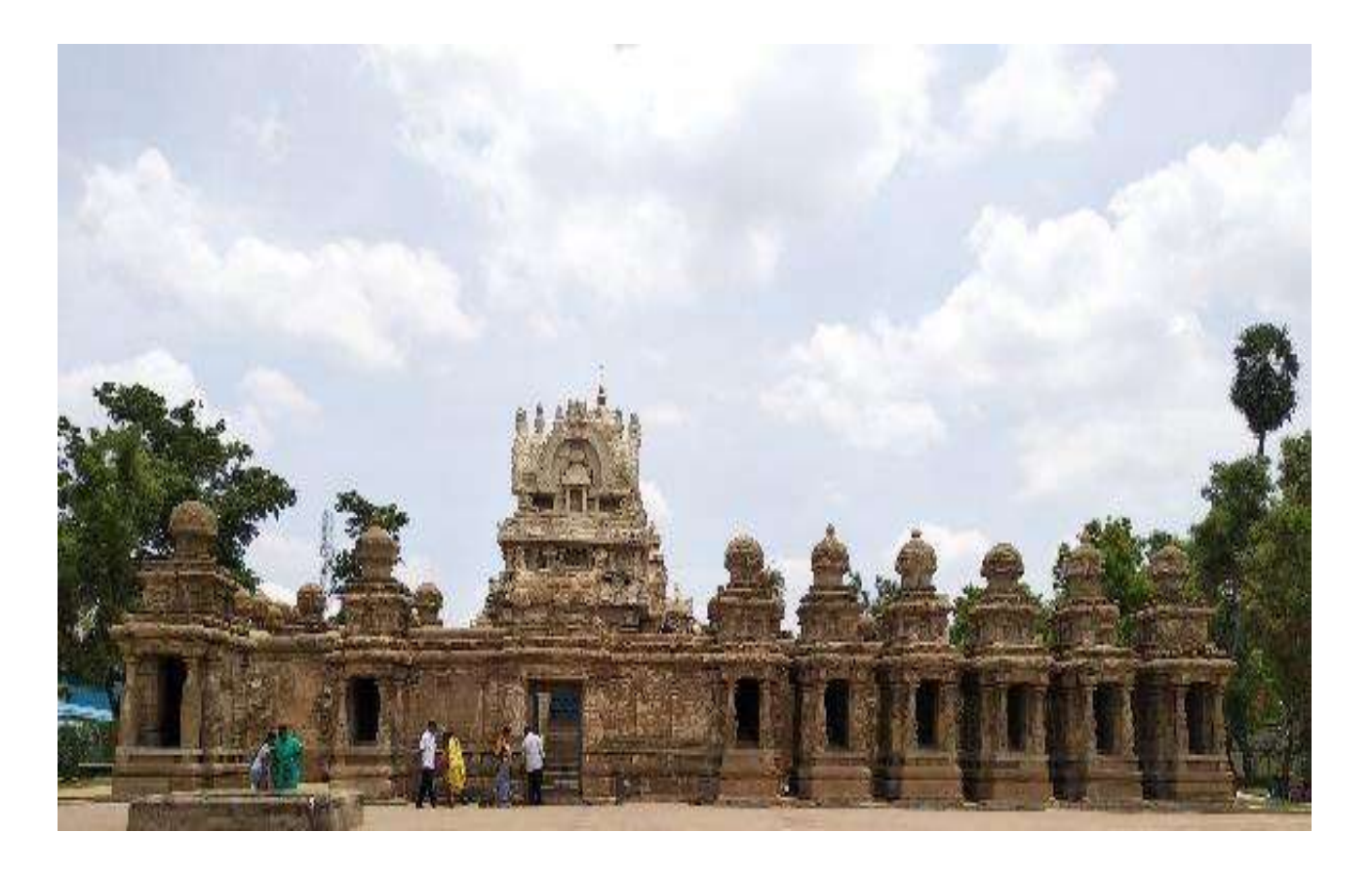
Figure 7 Front entrance of the Mahendravarman's shrine