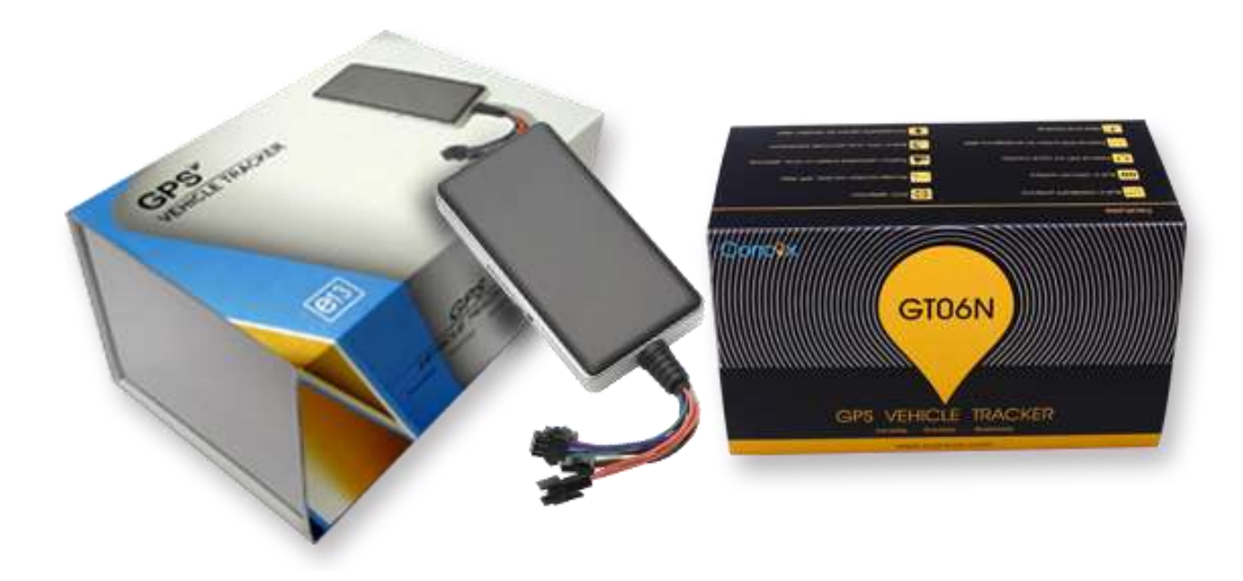
Figure 1. GT06N GPS Tracker

GT06N is the world's most popular GPS tracking device. After years of popularity around the world, it has obtained the trust, stability, and durability. Has many features, the battery-powered GT06N gives the real-time location viewing from the comfort of the electronic devices such as a computer or smartphone. It makes a suitable option for the vehicle tracking device. The following figure is the GT06N device [10].