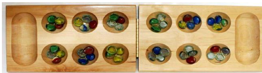
Figure 1: A typical I'tche (mancala) Board Game

The I'tche game has many name across Nigeria and much of Africa . The Yoruba people of southwest Nigeria calls it ayo while the Igbo people in southwest calls it Okwe . The Tiv people of Benue, Nigeria, calls it ateratar dar . OpenLearn Works (2016) provide series of name for the game such as Moruba (the pedi of South Africa), kpo (vai people of Sierra Leone and Liberia ), ajua (luo in Kenya), omweso (Ganda of Uganda), bao (Swahili in East Africa), gambatta (Ethiopia), and warri (Ashante in Ghana). Basically, the variant of the mancala game played across Nigeria is a board game comprising of a two rows of six holes (2 by 6) containing four seeds (or stones) each. The board is usually carved on a rectangular wooden surface, but several artistic designs of the board exists, often depicting the status of the owner or group of players (O'Connell, n.d).