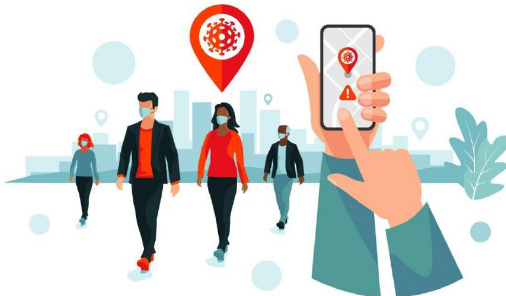
Figure 5. Identifying by alert

Fig4. Smartphones can be used to quickly and automatically determine whether somebody has been in contact with an infected person and gives alerts messages if any symptoms found.