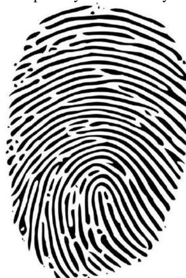
Figure 2. Thumb Impression