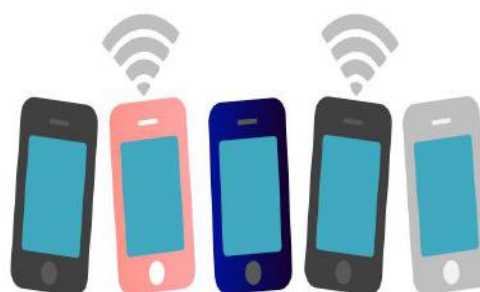
Figure 4. Smartphones

Fig3. Contact tracing aims to identify and alert people who have come into contact with a person infected with the virus.