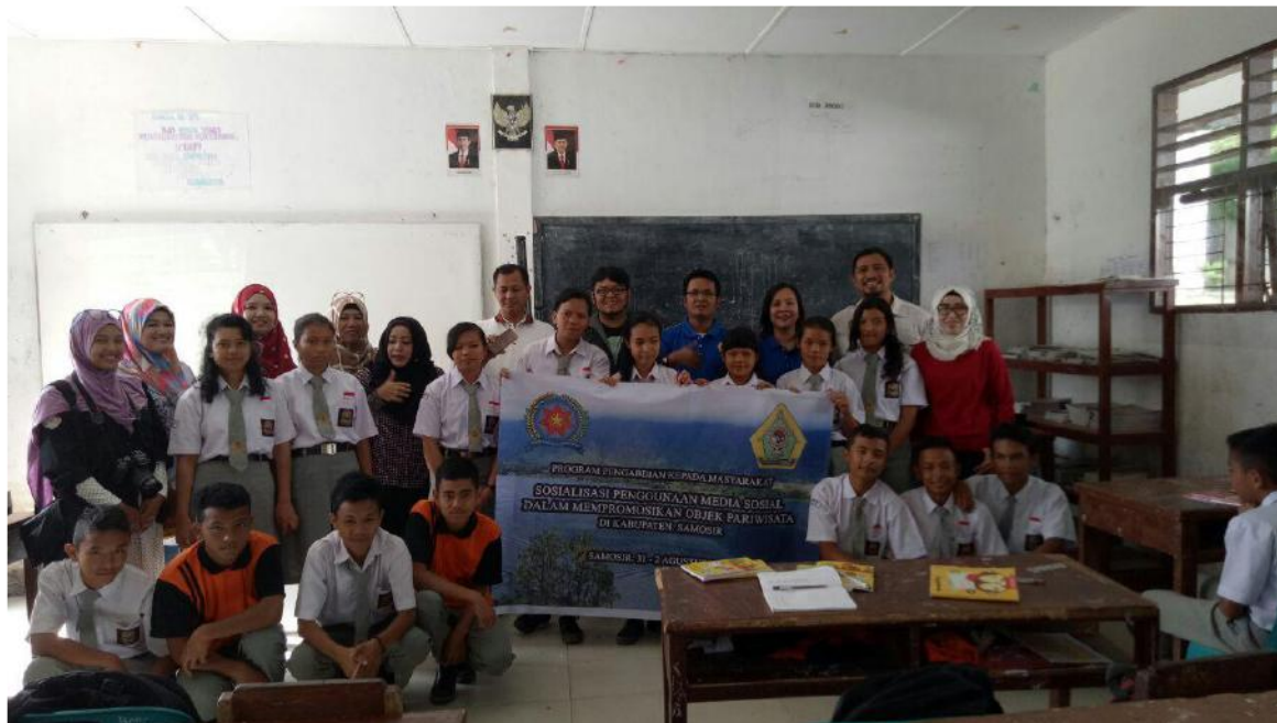
Figure 3: Trainee

The trainees are students at Sma Negeri 1 Simanindo Samosir Regency. Trainees consisting of Students of State High School 1 Simanindo, Samosir Regency who participated in this training can be seen in the picture below: