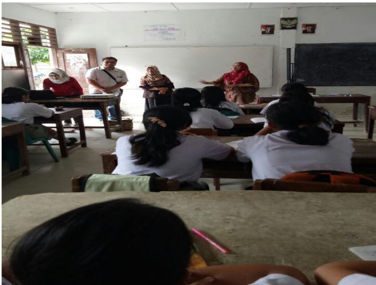
Figure 4: The students are practicing social media training