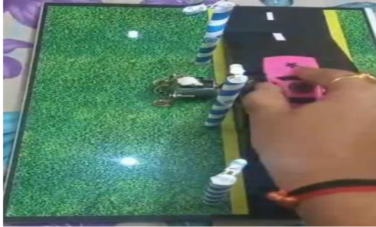
Fig.3 : Electricity generated

6.Powering LEDs: The stored energy is then used to power LED light strips or other low-power devices, often via a control circuit that can include inverters (to convert DC to AC if needed for specific systems) or light-sensing systems to activate the lights at night.