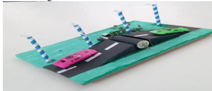
Fig.1 Electric power generation through speed breakers

Generating electricity from speed breakers involves converting a vehicle's kinetic energy into rotational motion via mechanisms like rack-and-pinion or chain-sprocket, driving a DC generator, charging a battery, and using an inverter to supply AC power, commonly for streetlights. The basic circuit connects the generator to a rectifier (if AC), then a charge controller to the battery, and finally an inverter to power loads, with a control circuit managing operations like automatic streetlights.